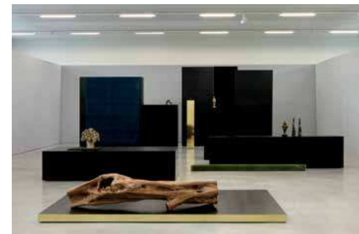
Left: Isabelle Cornaro, Paysage avec poussin et témoins oculaires (version VI) (Landscape with Poussin and Eyewitnesses [version VI]), 2014, wood, paint, brass sheet, log, stone, marble, brass urn, opaline, velvet, terra-cotta, bronze, brass chain, velvet. From the series "Paysage avec poussin et témoins oculaires," 2008–. Installation view, M Museum Leuven, Belgium.