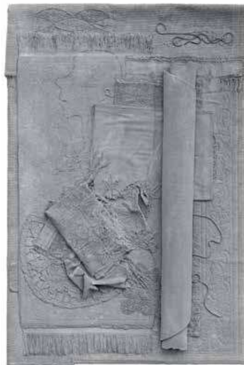
Left: Isabelle Cornaro, Homonymes II (#1, grey monochrome), 2012, dyed plaster, 70 1/8 x 47 1/4 x 7 1/8". From the series "Homonymes II," 2012–13.