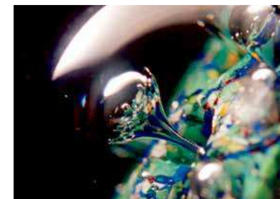
Above and left: Four stills from Isabelle Cornaro's Premier rêve d'Oskar Fischinger (Oskar Fischinger's First Dream), 2009, two 16-mm films transferred to two-channel HD video, color, silent, 1 minute 48 seconds and 1 minute 33 seconds.