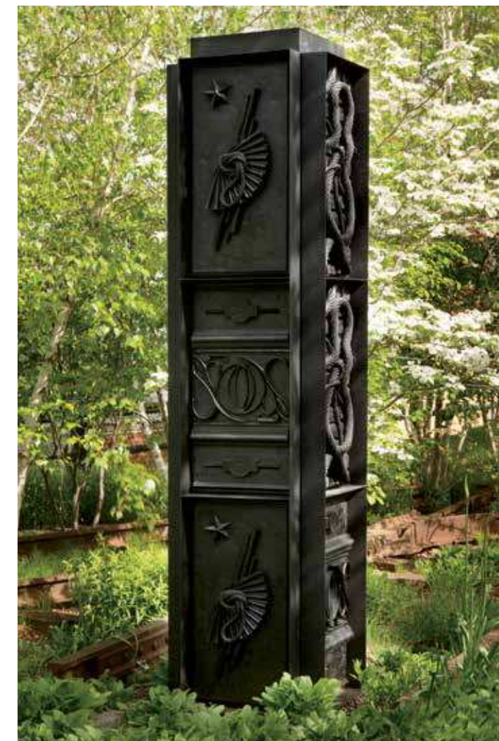
Right: Isabelle Cornaro, God Boxes (columns) , 2014, steel, resin. From the series "God Boxes (columns)," 2014. Installation view, High Line, New York, 2014.

ON NEW YORK'S HIGH LINE, between Gansevoort Street and the Standard Hotel, a black monolith encrusted with strange paneled reliefs rises from the disused railroad tracks that run through this elevated park. There seem to be objects embedded within the reliefs, but on closer inspection, it turns out that these are not actually lengths of rope or bricks, but casts of them fossilized in a tar-like rubber. Their ornamental arrangement suggests a message written in code, like the indecipherable hieroglyphics of some alien civilization emerging from the wreckage of our own. Thus arises the paradox that the obelisk seems to speak both a common contemporary parlance and a lost tongue.