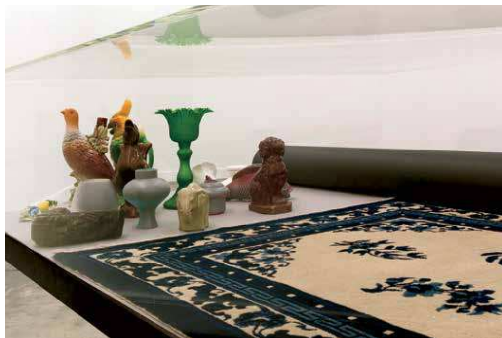
Right: Isabelle Cornaro, Le proche et le lointain I (The Near and the Distant I) (detail), 2011, six vitrines, colored paper, found objects, found fabrics, dimensions variable.