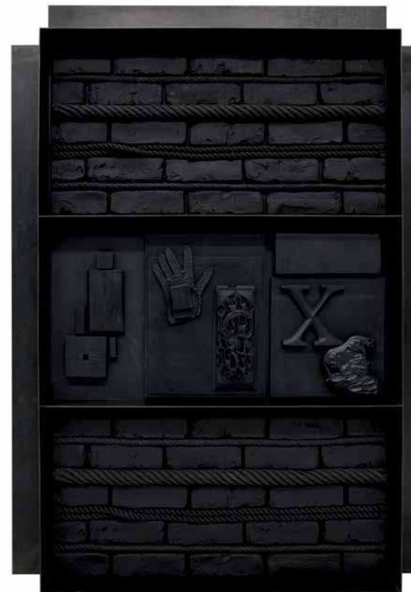
Right: Isabelle Cornaro, God Box #5, 2013, steel, rubber, 58 1/4 x 42 1/2 x 35 3/8". From the series "God Boxes," 2013.