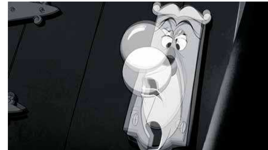
Three stills from Isabelle Cornaro's Celebration , 2013, three 16-mm films transferred to HD video, black-and-white and color, sound, infinite duration.

PAUL GALVEZ IS A VISITING LECTURER IN THE ART DEPARTMENT AT WELLESLEY COLLEGE, MASSACHUSETTS. (SEE CONTRIBUTORS.)